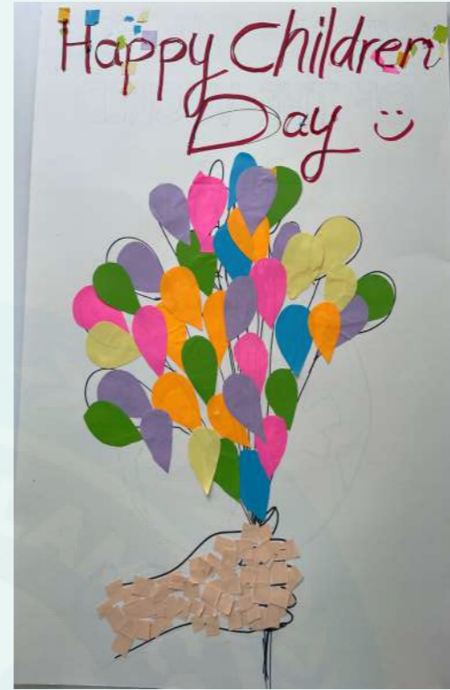
CLASS (II D) ABSK