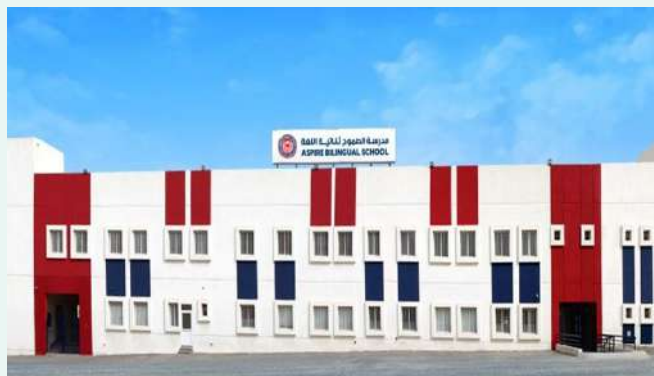
Aspire Bilingual School