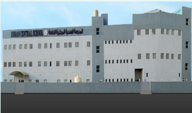
Indian Central School