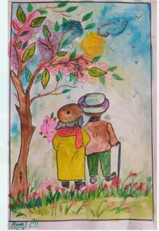
AMAL ALI (IX A) PES