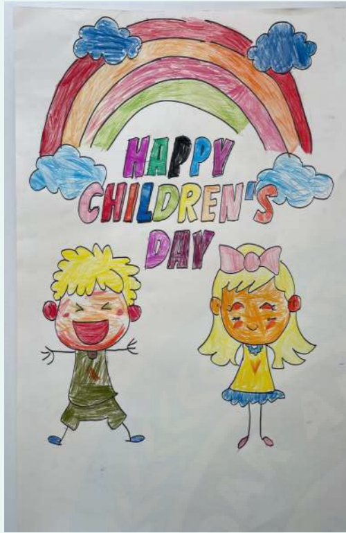
CLASS (I B) ABSK