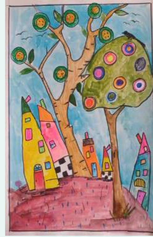
JAZA-E-ZAHRA (IX A) PES