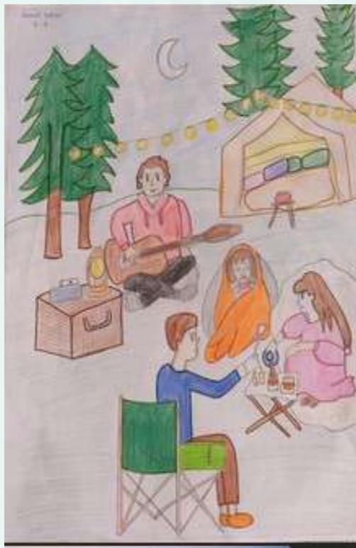
ZEEMAL SABIR (IX A) PES