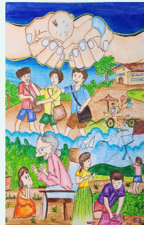
NEHA NAVAS (X B) ICS