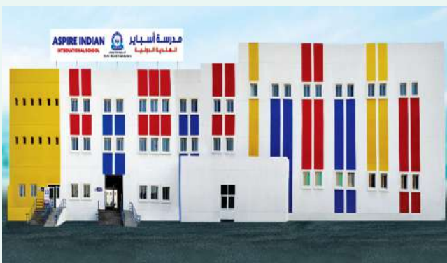
Aspire Indian International School