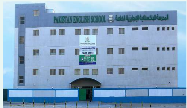
Pakistan English School