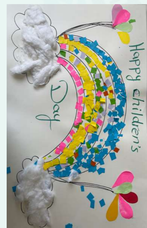
CLASS (II A) ABSK