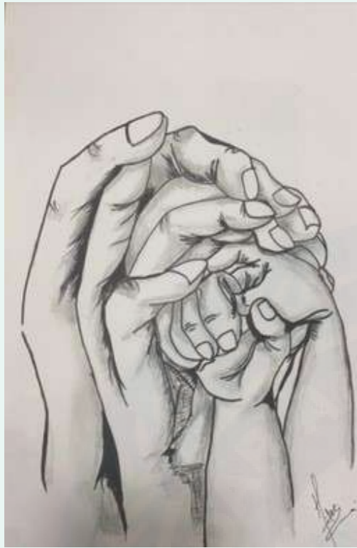
HIFZA TARIQ (IX A) PES