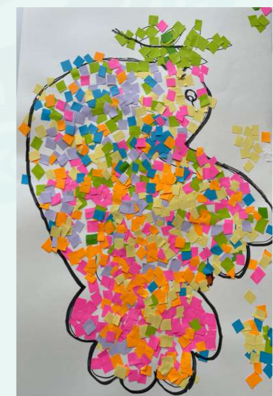
CLASS (I C) ABSK